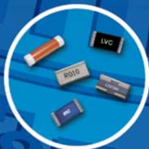
Surface mount chips