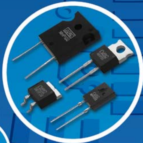
High power resistors